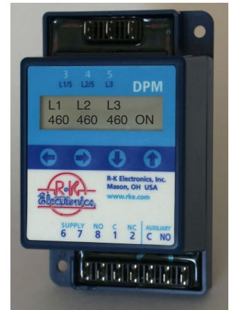
DPM with tabs (cover shows DPM with blocks)